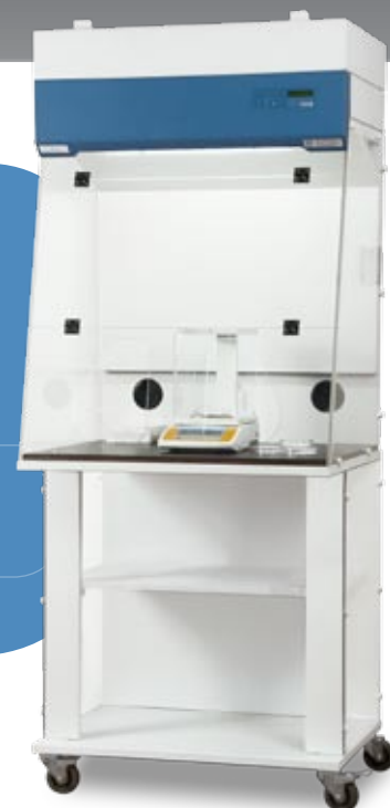
Esco Powdermax 1 Powder Weighing Balance Enclosure Model PW1-3A_